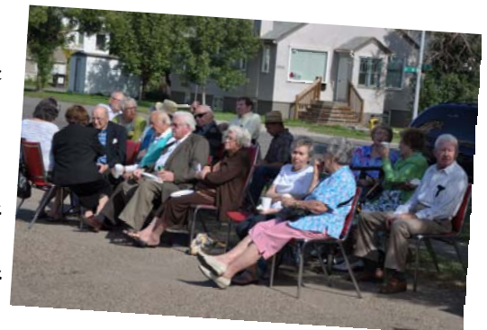
...für unsere Pastoren.

Trinity = 110 years strong. And still going strong!