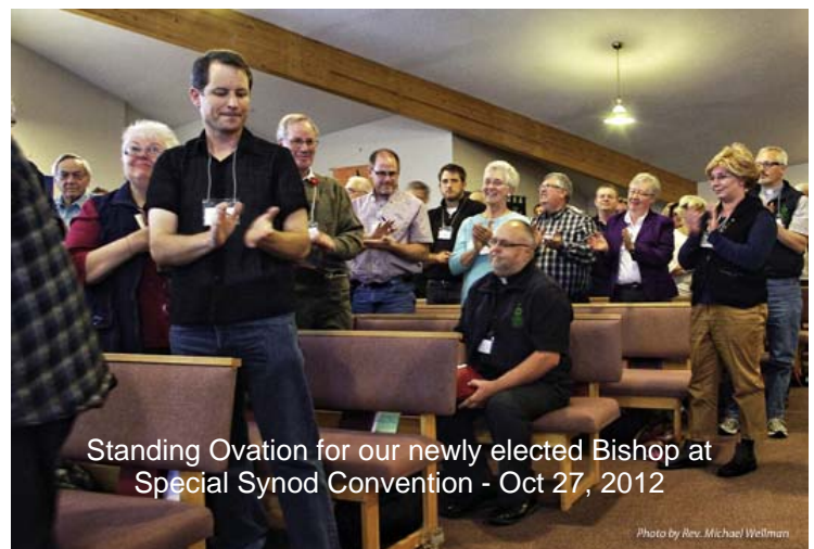
Standing Ovation for our newly elected Bishop at Special Synod Convention - Oct 27, 2012

Synod of Alberta and the Territories Evangelical Lutheran Church in Canada