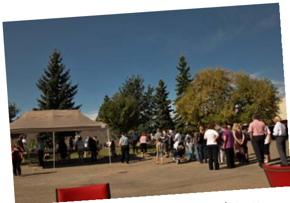
I am thankful for the love of Jesus, the grace of God and the community of the Holy Spirit.