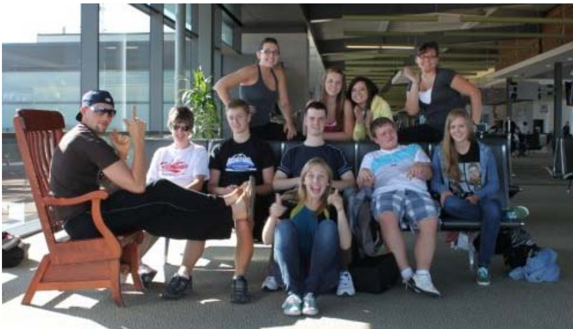
Trinity's contingent - waiting in the Ottawa airport - Aug 2010